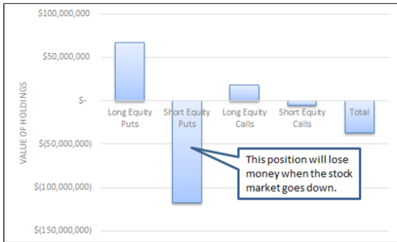
Alpha 250's Equity Options Holdings As of 2/29/2020

Similarly, the Fund's position in volatility options was not "market-neutral," but would instead decline in value if there was an increase in volatility. As shown below, the $16 million short position in volatility calls would lose money when volatility rose, which typically happens when the market suffers a sharp decline. This, again, was contrary to the investment mandate that the Funds be "market-neutral" and hedged against volatility increases.