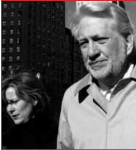
Former WorldCom CEO Bernard Ebbers

In the hush of the darkened courtroom, the plaintiffs’ attorney stopped the video clip and asked “where’s the original document?” When the audit partner had no answer, several members of the jury rolled their eyes and one scoffed aloud. In that single moment, Arthur Andersen’s credibility with the jury had evaporated. Two days later, Andersen agreed to pay $65 million to settle the case and end the trial, bringing the total value of settlements to that point to over $6.1 billion dollars and putting an excla-