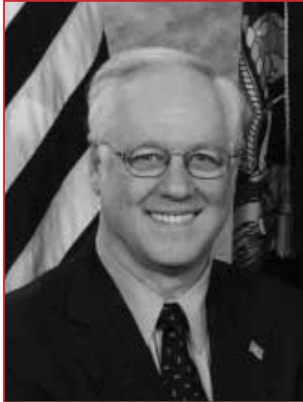
Alan Hevesi, Sole Trustee of the New York State Common Retirement Fund

Seeking these materials had another benefit as well: it opened a vital line of communication between the United States Attorney's office and the SEC on the one hand and the NYSCRF and Lead Counsel on the other. In large securities class actions, the government attorneys and the civil plaintiffs often work at cross-purposes. The government is focused on the criminal prosecutions of a handful of former employees and views the civil litigation as a disruptive side-show that can imperil the criminal case by prematurely disclosing key documents and testimony from key witnesses. For this reason, it is not uncommon for the government to seek to stay class action litigations pending resolution of criminal proceedings; a request that courts almost always grant.